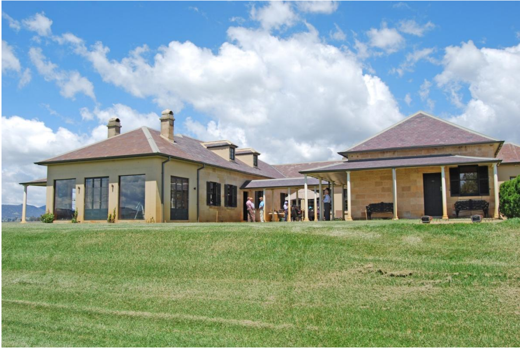
Dabee homestead from the north, showing the service wing, (originally detached) on the right.

Note that the dormers on the main house were only seen from the rear (John Broadley)