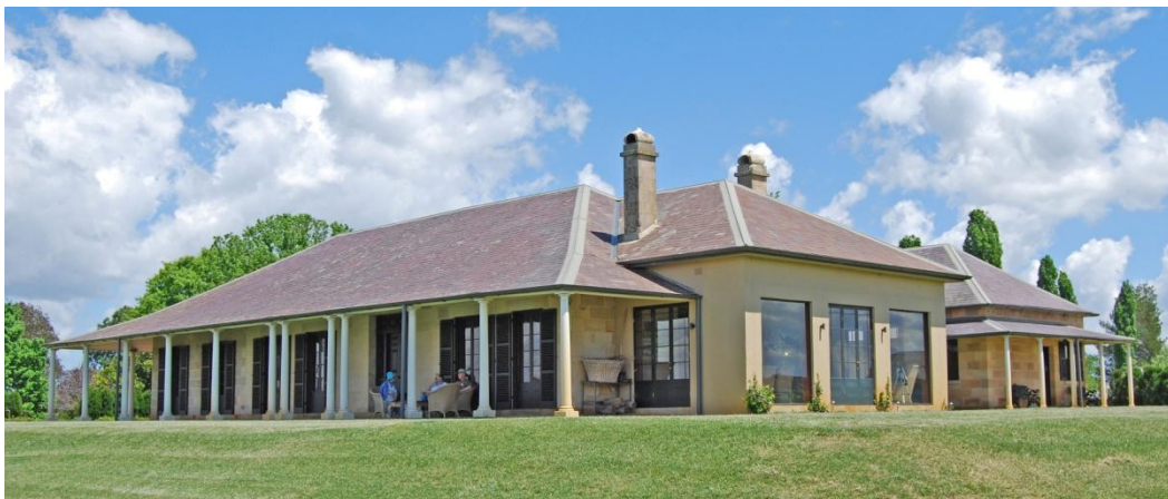
Dabee homestead from the north-east, showing the original eastern front to the left (John Broadley)